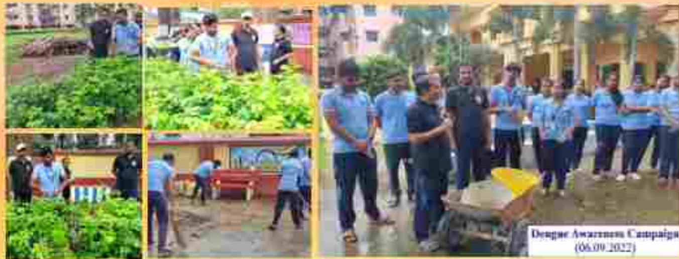
Dengue Awareness Campaign (06.09.2022)