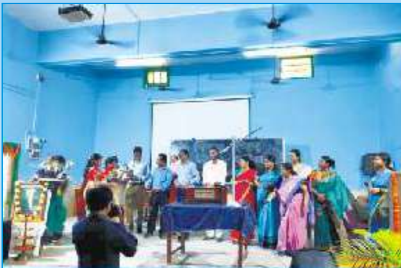
On Vidyasagar Birthday 26 th sept 2019